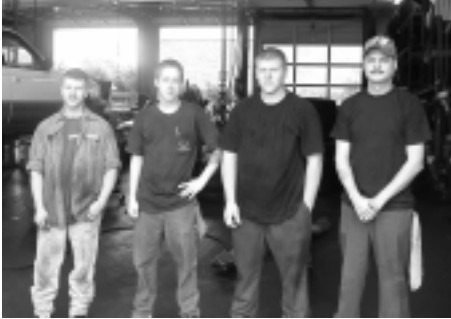
The Goodyear Service Store Gang!

“On August 15, 2002 we ratified a new three-year contract. We are proud to be a part of Local 831 and appreciate the work Local 831 does in the community.”